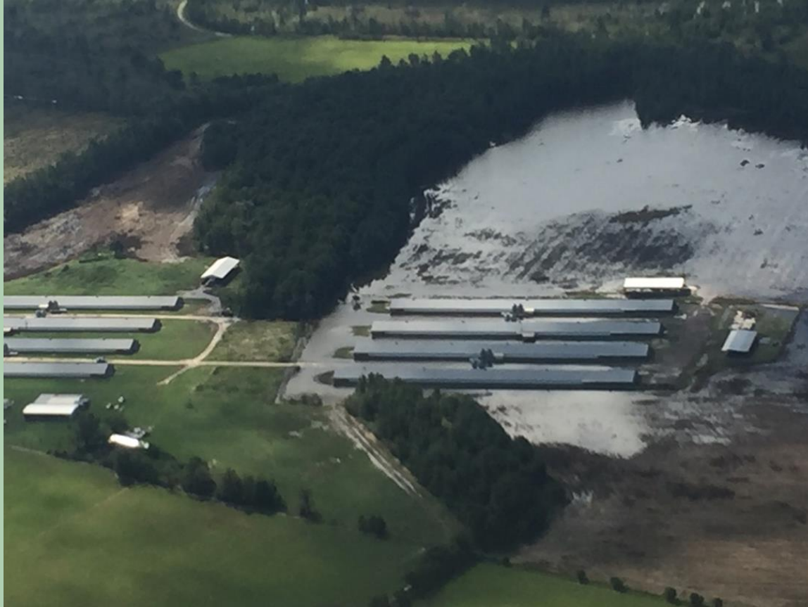
Poultry Farm in Clarendon County