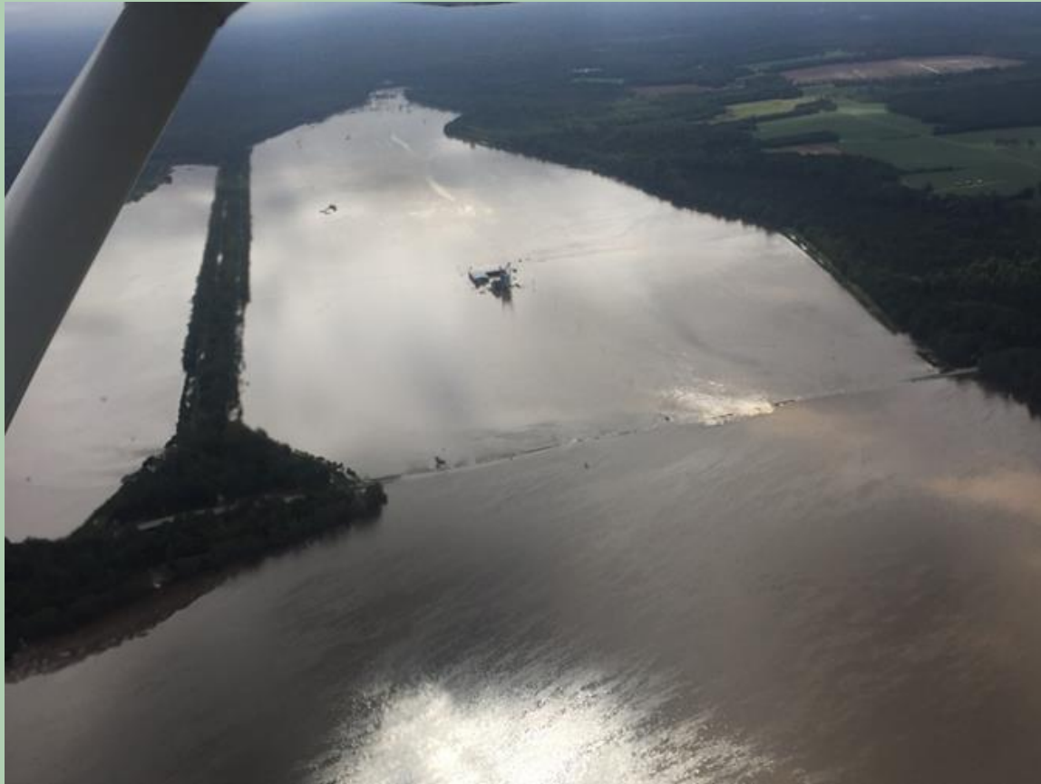
Aerial Photo Taken October 5, 2015