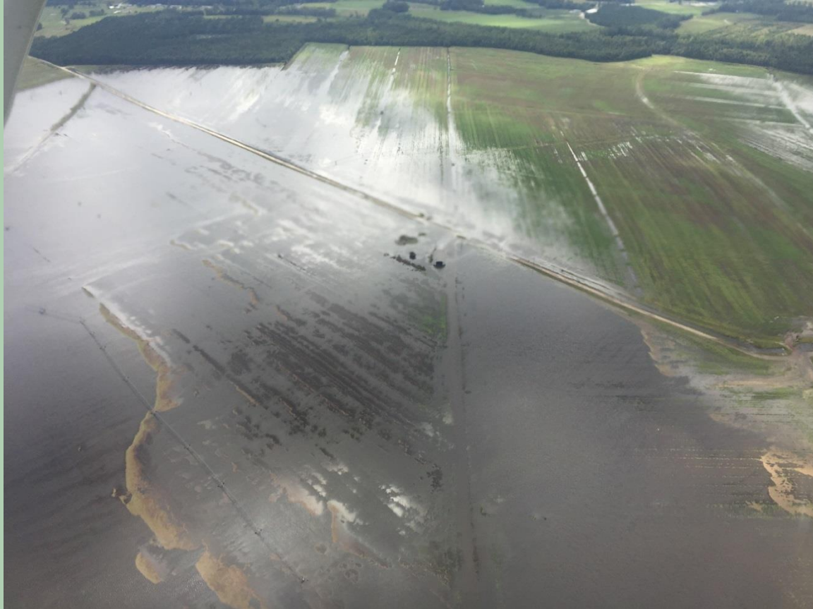
Farm in Darlington County